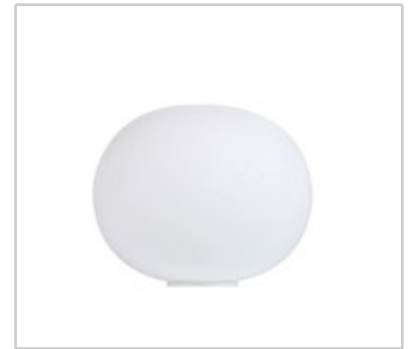
Glo-Ball Basic 1 design by Jasper Morrison

Table/desk lamp providing diffused light