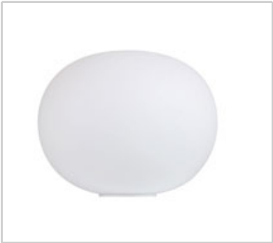
Glo-Ball Basic 2 design by Jasper Morrison

Table/desk lamp providing diffused light